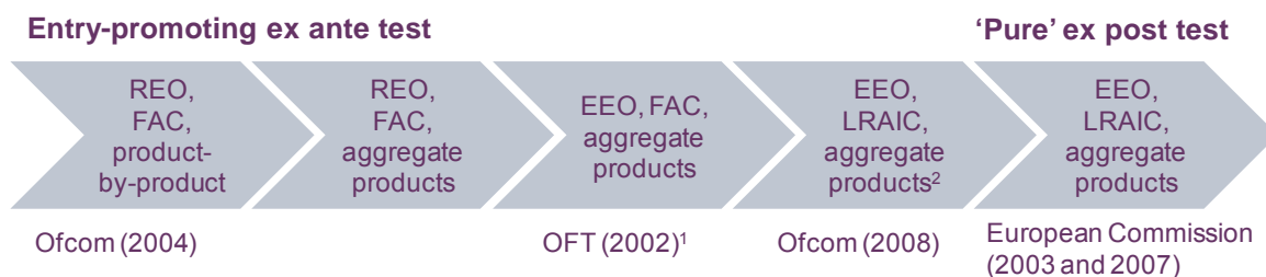
Figure 2 Margin squeeze test: a spectrum of implementation

Similar arguments could be made about the ex post approach. For example, entrants may argue that the